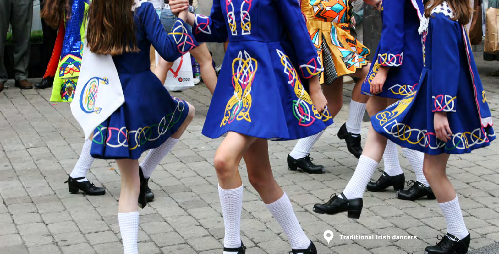
Traditional Irish dancers